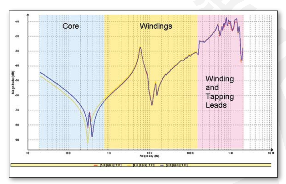
This graph shows a typical trace for a Star-Delta transformer with the LV open circuited. The highlighted regions indicate the parts of the transformer predominantly affecting the different frequency ranges

PBA have performed these tests on several transformers around New Zealand and have found the results to be very promising. SFRA tests were completed on a transformer which had recently experienced a fault and accurate comparisons were made between this unit and it's sister unit. This reaffirmed the diagnosis of the